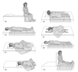
Figure 18.1 Patient Positions (a) Sitting (b) Supine (c) Dorsal recumbent (d) Lithotomy (e) Sims' (f) Knee-chest (g) Prone (h) Fowler's